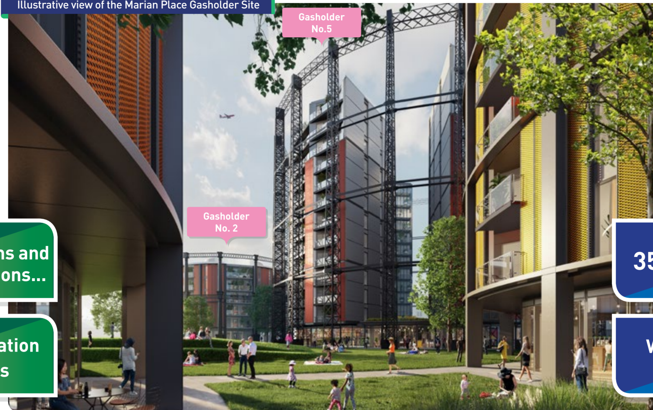
Illustrative view of the Marian Place Gasholder Site