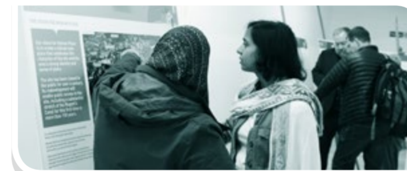
Public Exhibition, May 2019

You asked for new high quality, interesting and useable public open spaces to be provided, including green space and a children's play space. Our proposals include over 1.75 acres of public open space including a large central lawn space, children's play space, outdoor seating and sports and recreation facilities – there will be something for everyone.