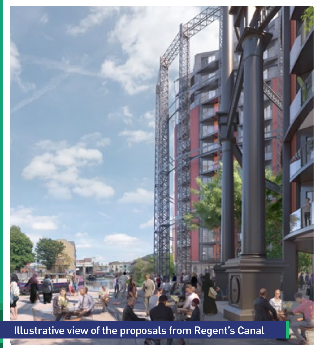
Illustrative view of the proposals from Regent's Canal

Following the public exhibition we have reviewed all of the feedback received which has influenced the design development and evolution of the proposals.