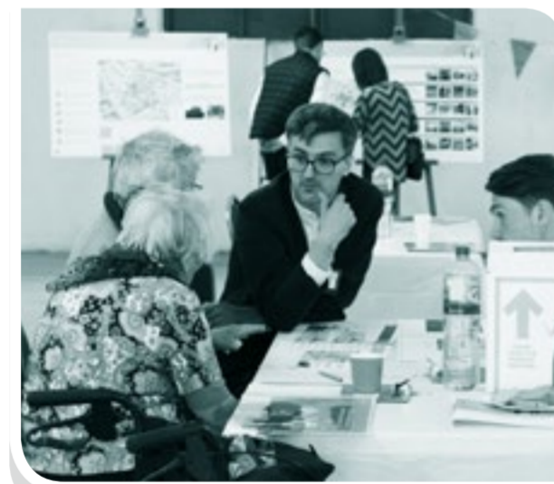
Public Exhibition, May 2019

You wanted us to retain the existing gasholders and incorporate them in our proposed redevelopment of the site. Our proposals celebrate the industrial heritage of the site and include the refurbishment and retention of both gasholders no.2 and no.5.