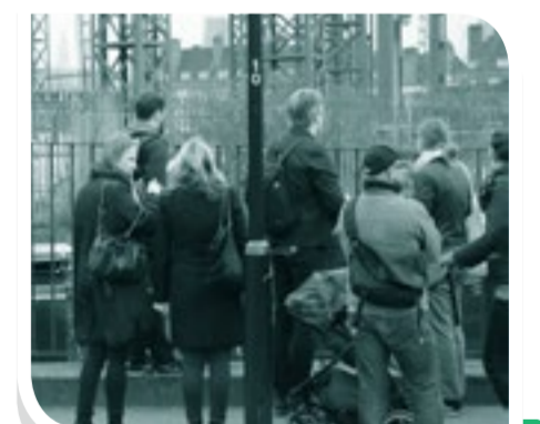
Walk & Talk, April 2019

The canal is loved by the community and you wanted St William to provide public access to the Regent's Canal front. Our proposals will create a new public realm utilising the full extent of the sites 94m frontage to the Regent's Canal.