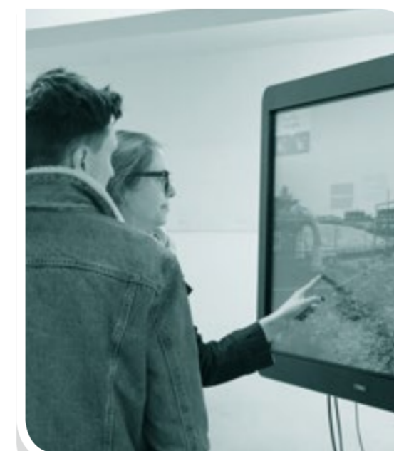
Public Exhibition, May 2019

You asked for new commercial spaces that compliment existing local businesses and contribute to the vitality of the area. Our proposals include a mix of new commercial spaces including for shops, cafes, restaurants, leisure and workspaces. Of the workspace, 10% will be affordable workspace.