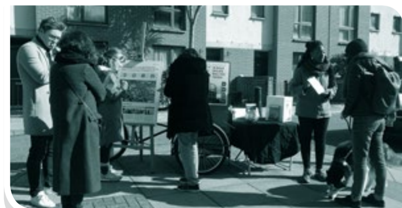
Pop-up, February 2019

You wanted the proposals to include green spaces that enhance biodiversity. We have committed to delivering a net biodiversity gain.